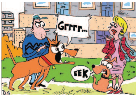
Aggressive dogs and their owners can cause distress

Different types of anti-social behaviour are dealt with by different agencies and it is important that you contact the right one for your particular concern. Here is a guide to which agency deals with which type of ASB.